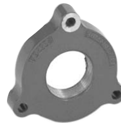
JPA 64 Conduit Adapter

Adapters are tapped NPT standard pipe thread to accommodate rigid conduit or standard connectors for armored and non-metallic cable or flexible conduit.