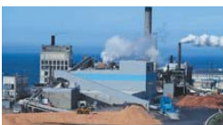
Pulp & Paper Mills