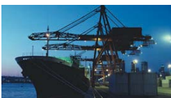
Marine and Shipboard