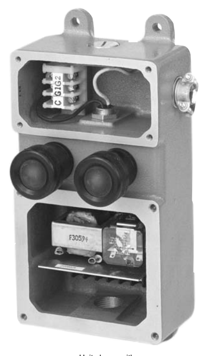
Unit shown with covers removed